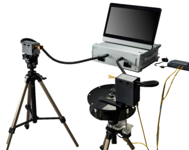
ShockLine MS46522B-082B Setup with DAMS