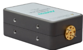
ShockLine MS46522B-082B E-band Module